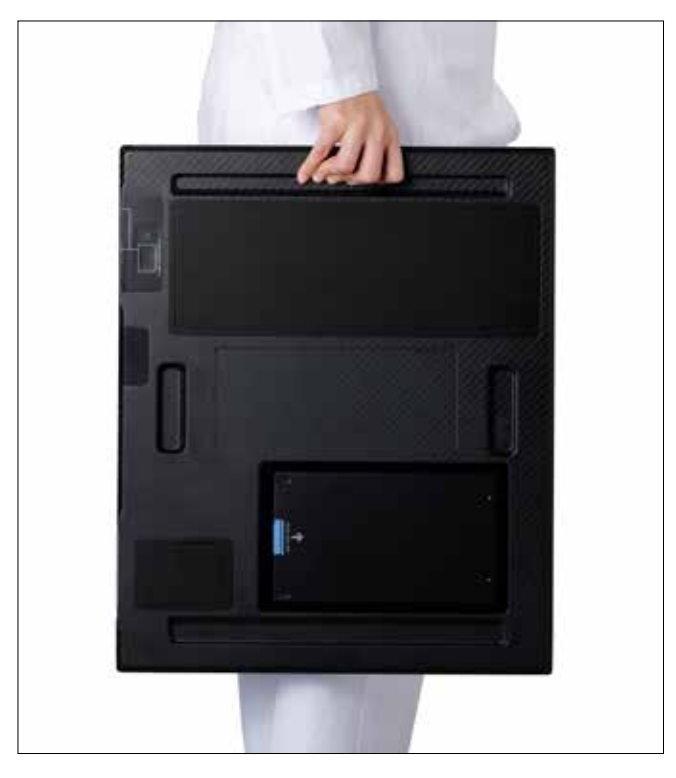
A comfortable hand grip enables efficient and easy transfer of the detectors.