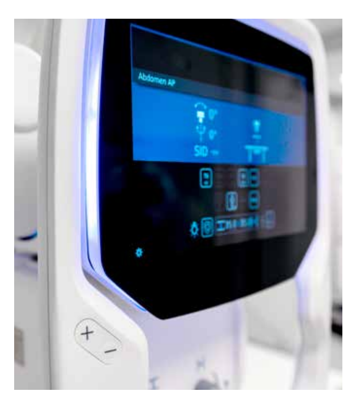
Arcoma Precision i5 offers a carefully designed glass overlay display completely without edges. This enables very easy cleaning and disinfection.