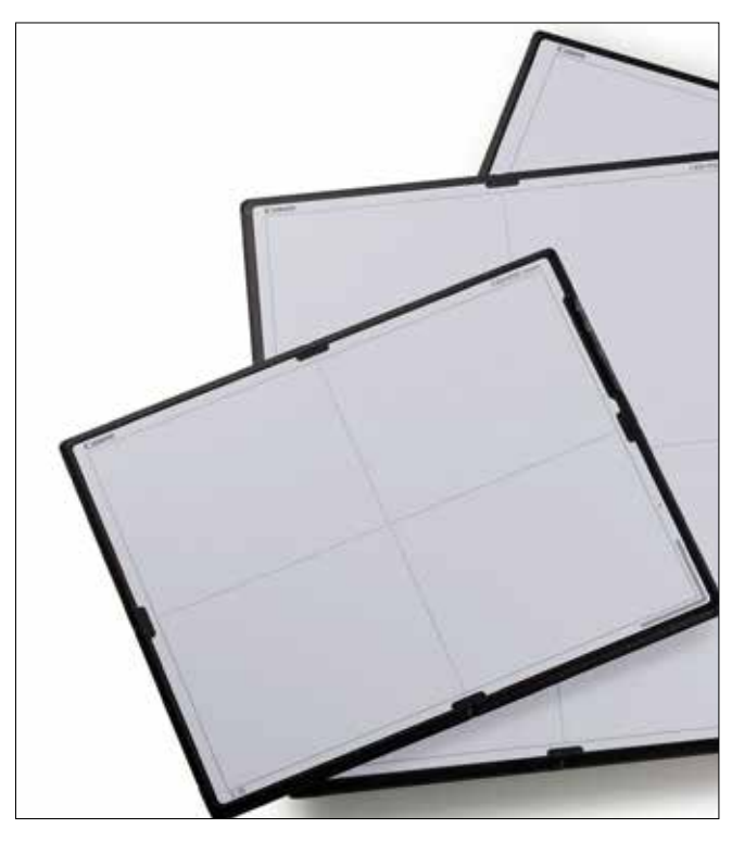
The detectors are portable and wireless, which together with Arcoma's X-ray system enables the highest possible patient throughput.