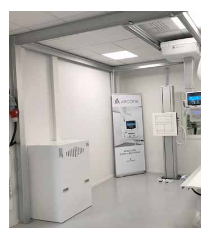
Arcoma Intuition installed with the Arcoma X-ray Cube.