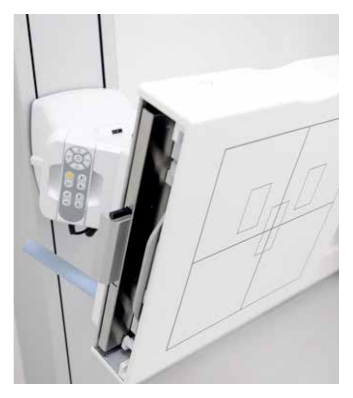
The wall stand with motorized tilt enables efficient examinations with minimal manual handling.